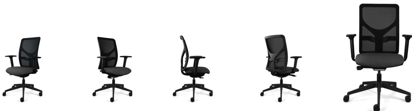
IMAGE 100 GREY BLACK MESH