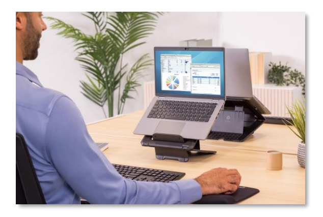
Ergonomic viewing Maintaining a comfortable viewing height reduces strain on your neck and eyes.

Breyta<sup>™</sup> is redefining workspaces. Inspired by evolving work styles, Breyta<sup>™</sup> features ergonomic accessories designed for comfort, portability, and ease of use. 100% recyclable and built to last, embrace modern design and sustainability. Elevate your workspace with Breyta<sup>™</sup> today.