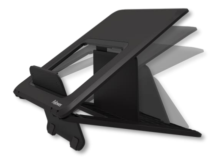
12 height settings

Easy to adjust height settings with foldout front legs to optimise screen positioning.