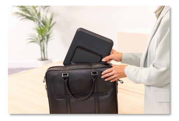
Folds flat For easy storage or on the move, perfect for agile working.