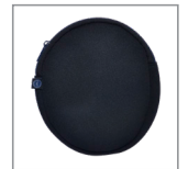
SOFT SHELL CARRY CASE