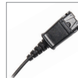
JPL/PLX COMPATIBLE QD