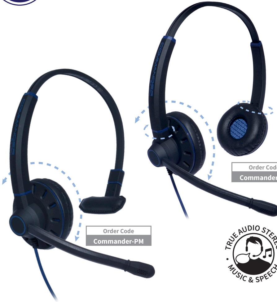
Order Code Commander-PM